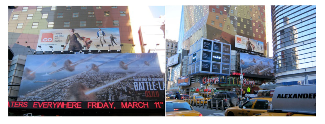
Figure 1: .CO Billboard in Times Square<sup>67</sup>